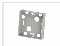
Back part for surface wiring 200.004