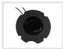
Loudspeaker LA 06.10