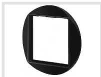
Mask Ø 72mm