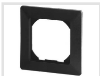
Mask 72 x 72