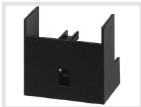
Terminal cover for BW 40.88