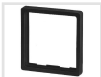
Trim 55 x 55