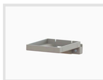
Mounting angle 200.002