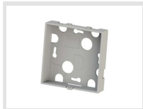
Back part for surface wiring 200.004