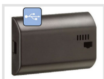
PP 50.00 pro