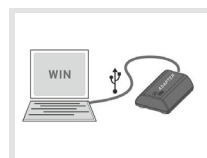
Software for PP50/PP60