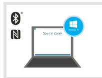
Save'n carry WIN10 App