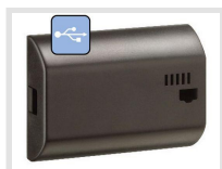
PP 50.00 pro