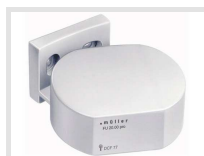
müller FU 20.00 pro