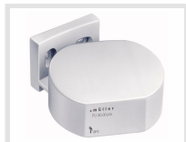
müller FU 3x.00 pro