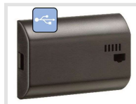
PP 50.00 pro