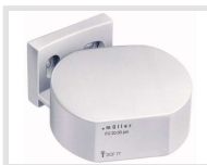
müller FU 20.00 pro