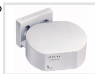
müller FU 3x.00 pro