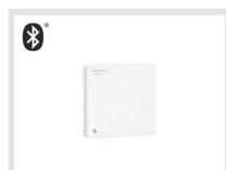
müller LS 20.00 pro4 mi.sensor