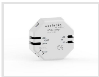
paladin 873 041 amp